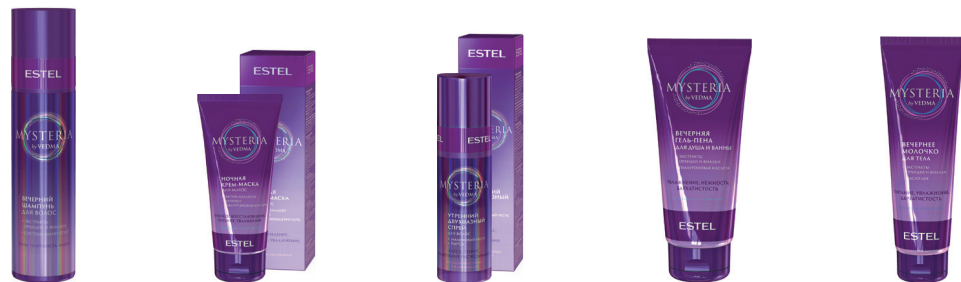
ESTEL MYSTERIA Evening Shampoo 250 ml