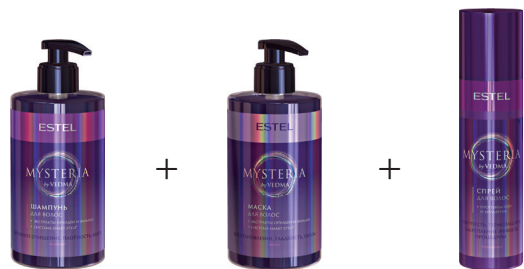
Step 1 ESTEL MYSTERIA Hair Shampoo 435 ml