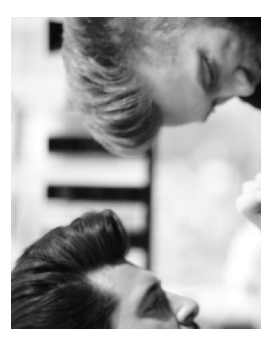
To win, one, first of all, has to play. Albert Einstein

The winner decides what he wants to be like.