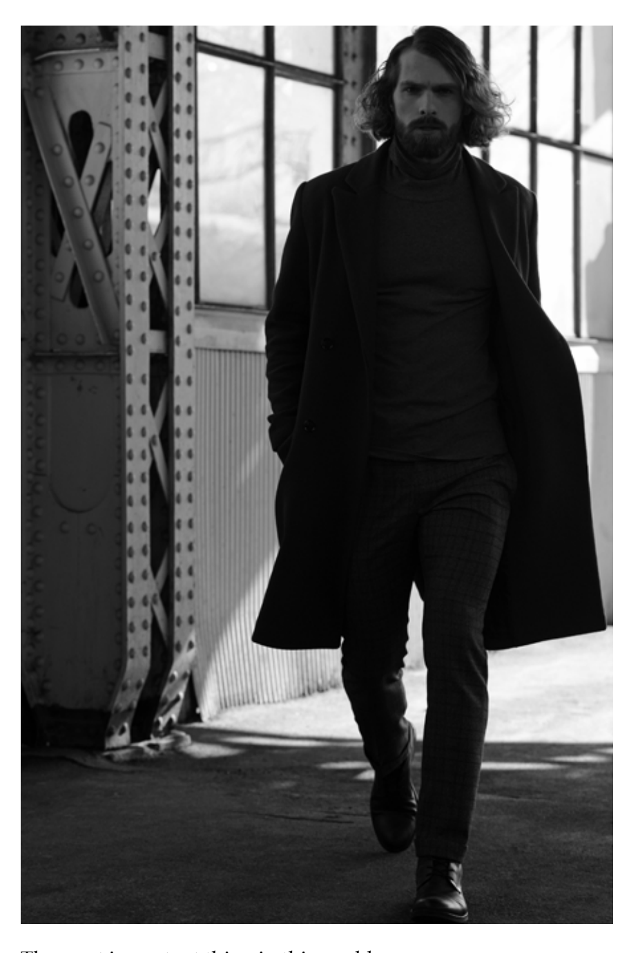
The most important thing in this world is not where we stand, but in what direction we are moving.